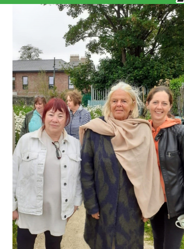
Trip to Sanctuary Dublin Funded by ECFRC