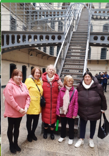
Trip to Kilmainham Jail Funded by ECFRC