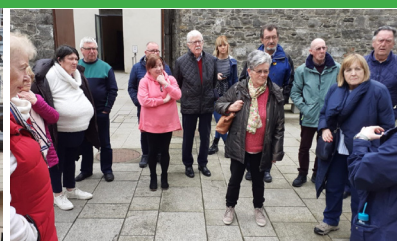
Age Ireland Event Fairy House. Funded by Meath County council.