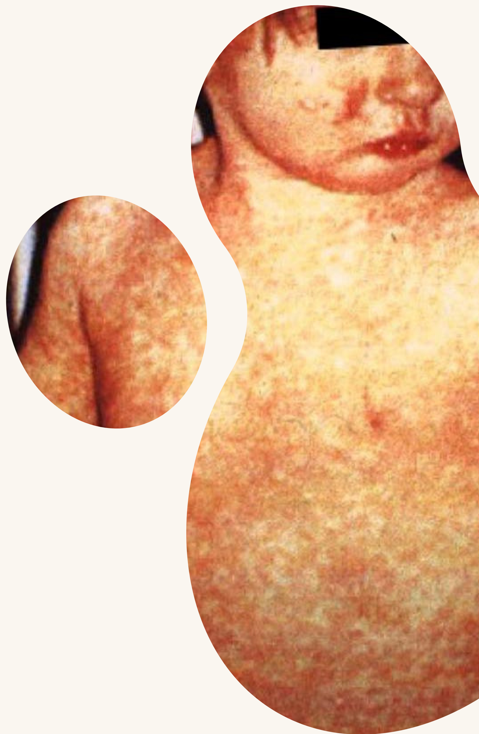
Example of measles rash.

Two doses of MMR are needed to give protection. Anyone who has missed their MMR can get measles.